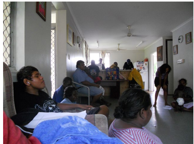
FIGURE 2. “Improvisation.” [This figure appears in color in the online issue.]

Behind the scenes, these different perspectives are given shape in outline form as people talk through various possible scenarios, sometimes in formal meetings, but just as often more informally, as people are driving somewhere, sitting around somewhere else (Figure 2). All scenes are improvised based on members’ experience, desires, and mutual understanding. This said, while the above expositions suggest neither wholesale acceptance nor rejection of liberal settler terms and conditions but rather a grappling with its incessant demands and having fun in the process, Karrabing filmmaking is not about substituting an avant Indigenous cinematic practice to replace that of Hollywood, or for that matter, government-generated truth claims, with counterclaims about Indigenous alterity. Instead, they are a practice of critical probing of the conditions (of continuation) within which the lived realities of Indigenous lifeworlds proceed. And herein lies the rub for